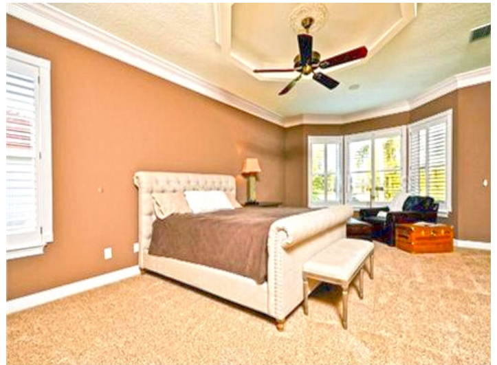
Bright bedroom with double bed