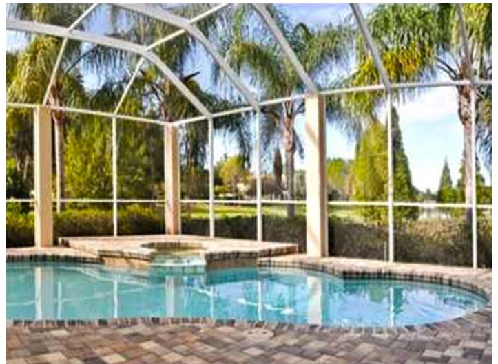
Glazed private swimming pool

Alle Angaben nach bestem Wissen. Irrtum und Zwischenverkauf vorbehalten. Dieses Exposé ist eine Vorinformation, als Rechtsgrundlage gilt allein der notariell abgeschlossene Kaufvertrag.