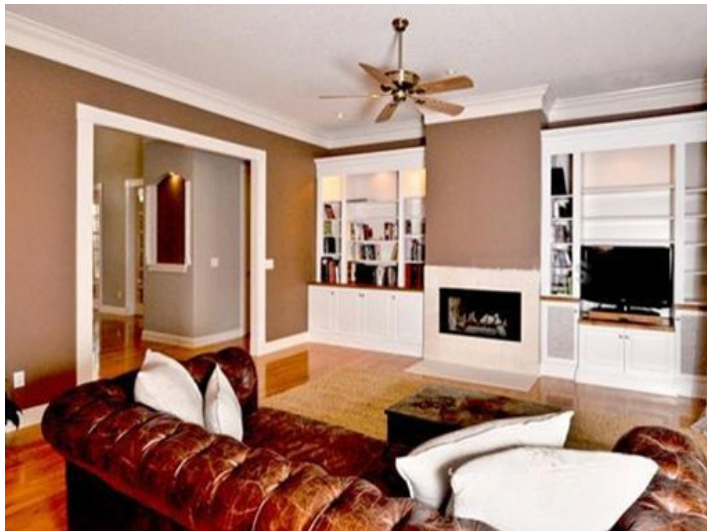
Spacious living room with the fireplace